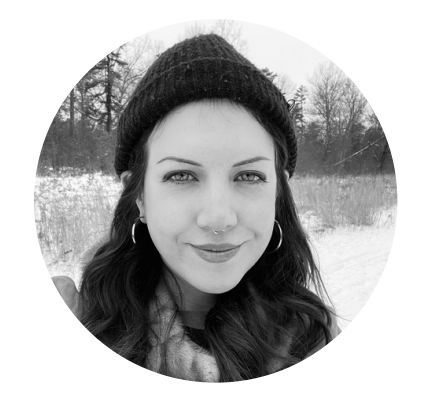
Dakota Wedding Coordinator