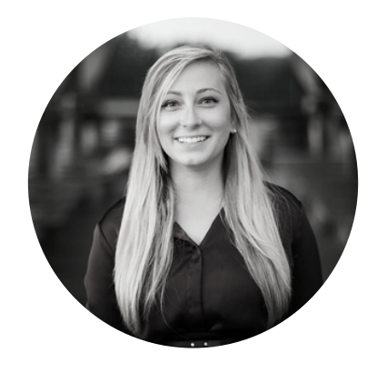
Shannon Wedding Planner